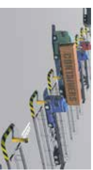
Transfer point kiosks assist truckers at container interchange zone.