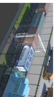
Rail OCR portal for automated inspection, identification and inventory of railcars and containers.