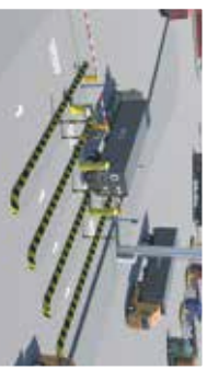
Driver kiosks at the truck gates validate data and present drop & pick-up location.