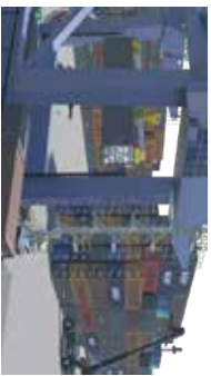
BoxCatcher /ARMG Crane OCR