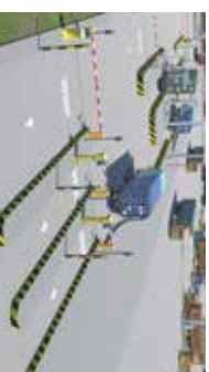
Pre-gate kiosks allow checks at terminal entry and exit.