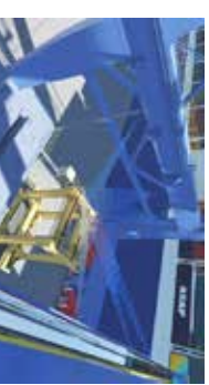
Micro Location Technology under STS crane to optimize TT & SC alignment