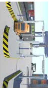
Truck OCR portals capture container data and images of in- and outbound traffic.