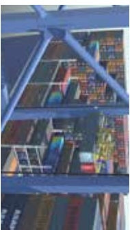
BoxCatcher STS Crane OCR to identify containers during loading & discharge.